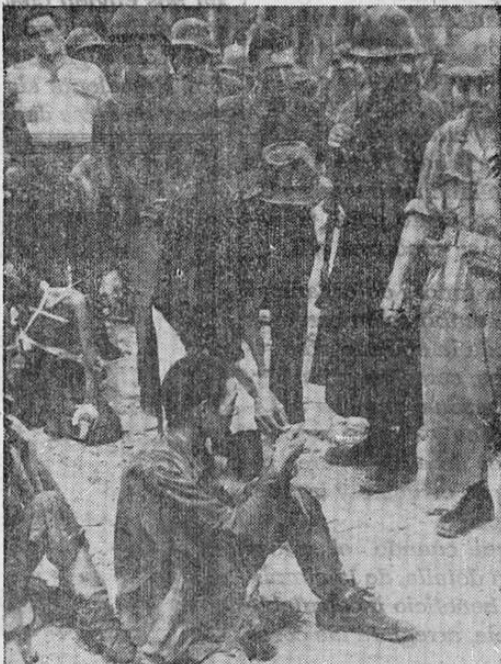
Un chino que había sido capturado por los japoneses y luego fué libertado por las tropas norteamericanas, enciende generosamente el cigarrillo de uno de sus victimarios en un campo de prisioneros.