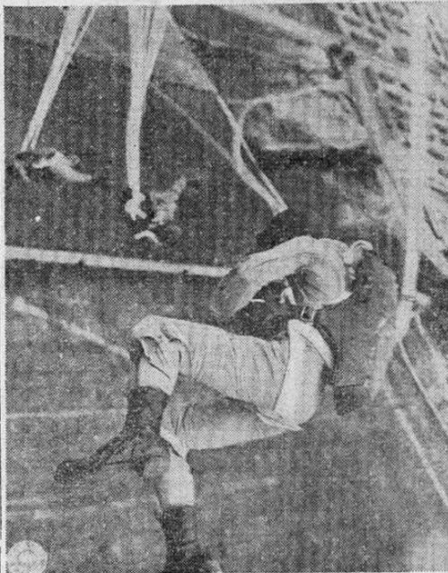
Un lanzamiento de paracaidistas norteamericanos que están terminando el riguroso entrenamiento a que son sometidos antes de ser enviados al frente.