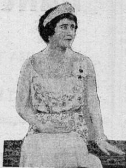
H. M. the Queen

Forty three years ago last Wednesday was born at the Scotch Castle of Glamis, home of age-old traditions dating from the time of Macbeth, immortalised in Shakespeare's famous tragedy, the Lady Elizabeth Angela Eowes Lyon who in her twenty third year became the wife of the then Duke of York, now head of the vast British Commonwealth of Nations. This noble lady assumed on her husband's accession, without cavil, her duties as Queen, and so well has she acquitted herself, that she stands now as the true prototype and example to all British womanhood. Her unaffected dignity, sweet and sympathetic nature, and sincere interest in the welfare of all her subjects, and in particular of those of her own sex, have endeared her to all hearts wherethrough runs British blood.