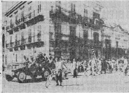
Las tropas norteamericanas hacen su entrada triunfal en la ciudad de Palermo, capital de Sicilia, ocupada después de un rápido avance que cortó la isla por la mitad. La población civil tributó una cálida acogida al ejército libertador y enarboló la bandera de los Estados Unidos.